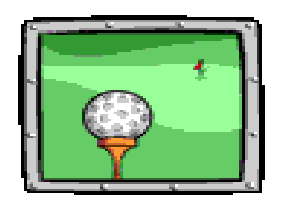
TWILIGHT LEAGUE SIGN-UPS