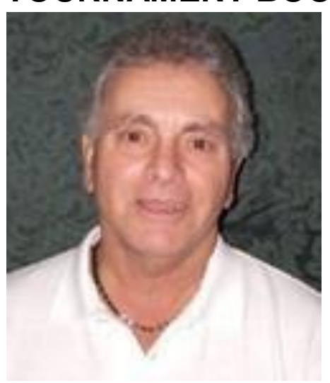
Happy New year to all RGC golfers

I am your tournament bookkeeper and hope to do a good job for all. Just a reminder that when you get the schedule and notices for due dates please pay attention and try and enter on time. As in the past if something comes up and you must cancel you will get a refund as long as you let the tournament director know in time. I will run this like it has been in the past, with refund envelops on hand at the next event, or for a six month period. I also will have envelopes for skins won and not collected on the paly date. Those of you who use pay pal I try and refund your account if I know you have dropped out before I transfer the money. Also if you know you are missing a dead line just call me before deadline and I will get you in and collect the money later. My phone number is listed on the web site and I am open to talk and help you out in any way I can. I want to make this whole job and process as easy for me and you as possible.