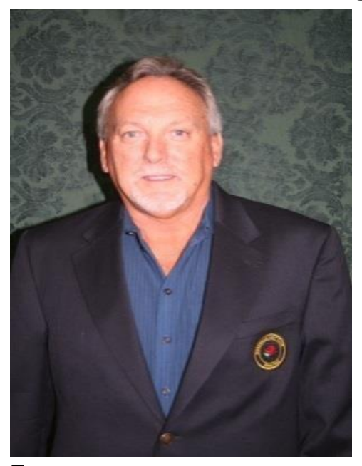
EQUITABLE STROKE CONTROL